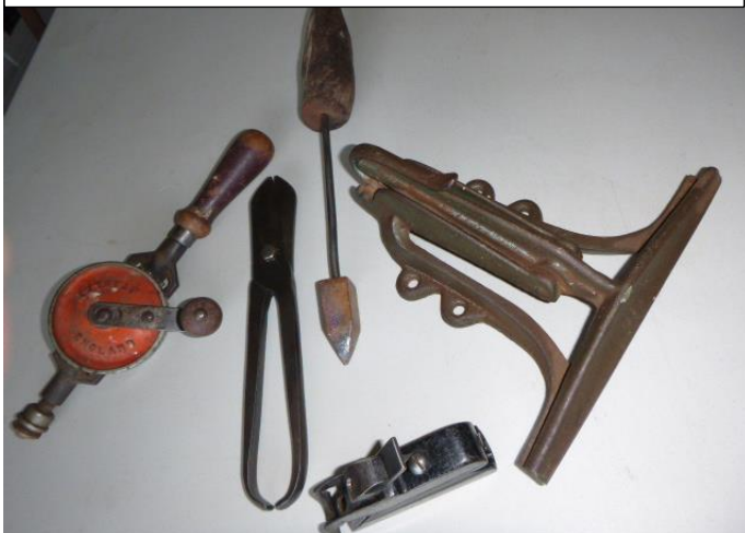
Brace, tin snips, solder iron, small plane & a saw vice